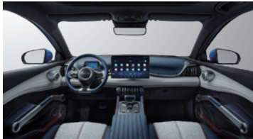
Blue and grey